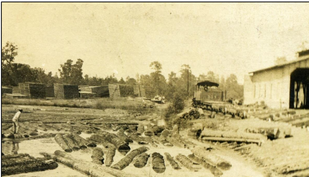
Crowell and Spencer engine #303 is seen here dumping logs into the Long Leaf mill pond. The machine shop is to the right in the photo.

The machine shop was critical to the operation of the sawmill complex and to the operation of the RR&G Railroad. In addition to Long Leaf, the Crowell family developed sawmills at Meridian and Alco (Smith 2007). Long Leaf then became the central operating point for the Crowell Railroad network and its logging network. From the three Crowell shay locomotives, and RR&G 2-6-2 #1, the Crowell operations added two Meridian locomotives, second hand 4-6-0 #101 and brand new 2-6-0 #202. By 1915, two more engines had been added to the fleet, Crowell 2-6-2 #303 and Red River and Gulf 4-6-0 #102. Meridian #101 and RR&G #1 had swapped companies, but just the same there were now 8 engines being maintained out of Long Leaf. Certainly, a large machine shop/engine house was necessary by this time.