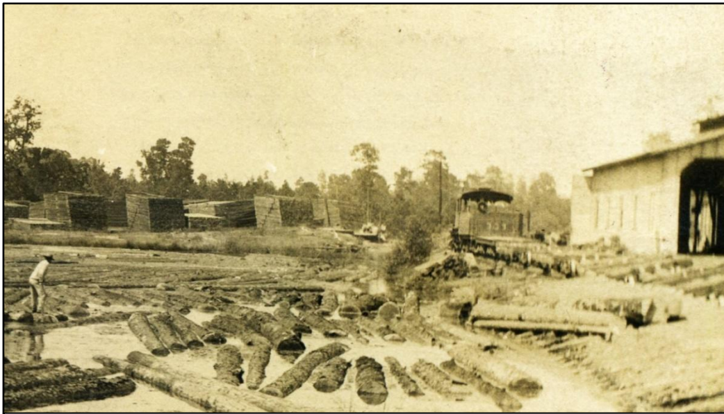
Crowell and Spencer engine #303 is seen here dumping logs into the Long Leaf mill pond. The machine shop is to the right in the photo.